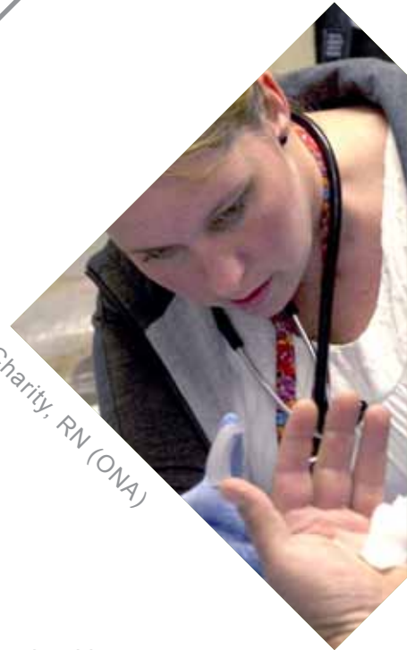
Charity, RN (ONA)

Growing health care workforce shortages, cost-conscious health care budgets, and quality and safety concerns have spurred many workforce redesign initiatives within health care. Nurses comprise the largest proportion of the health care workforce, and many initiatives focus on nursing care delivery redesign or new ways to deliver nursing care (Kimball et al., 2007).