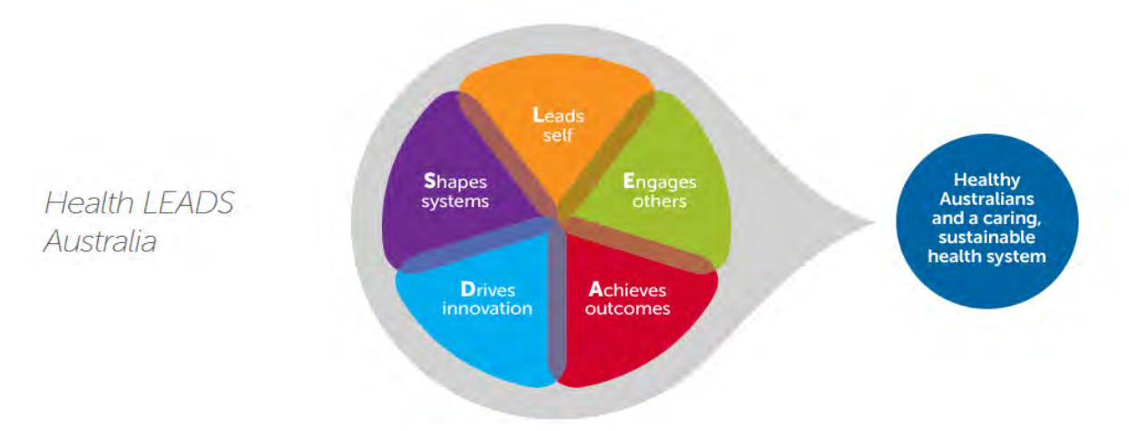
Figure 3: Health LEADS Australia Framework

As the recent Australia experience shows, any vision and strategy must include clear, regular, and effective communication channels and engagement strategies. There must be processes to ensure that groups such as patients, physicians, nurses, and other providers have a voice.<sup>33</sup> This means involvement in decision-making to become agents of change. Both horizontal and vertical listening must occur. It is no longer just the formal leaders who have the power and privilege that accompany a senior position in health care. Power has been shifted to those who have the ability to influence others, often through the use of Internet and social media.<sup>34</sup> Leaders must see engagement of these stakeholders as a continuum (more or less engaged), within a context (such as with patients, organizational goals, etc.).